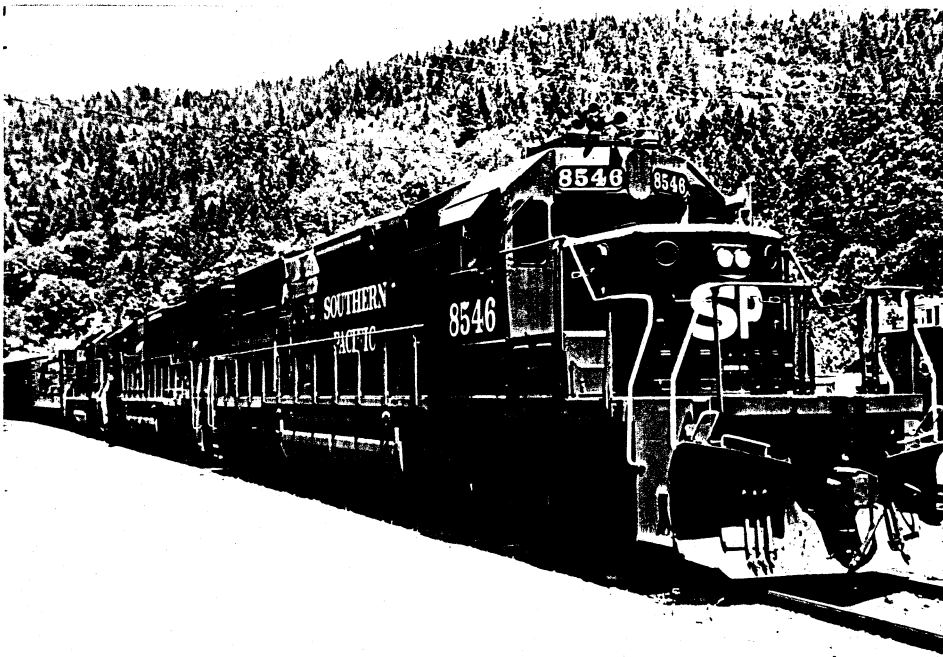
At Left: Southern Pacific SD40T-2 8546 leads a westbound freight from Oregon at Dunsmuir, CA.

Name Address City, State Zip Phone # Age