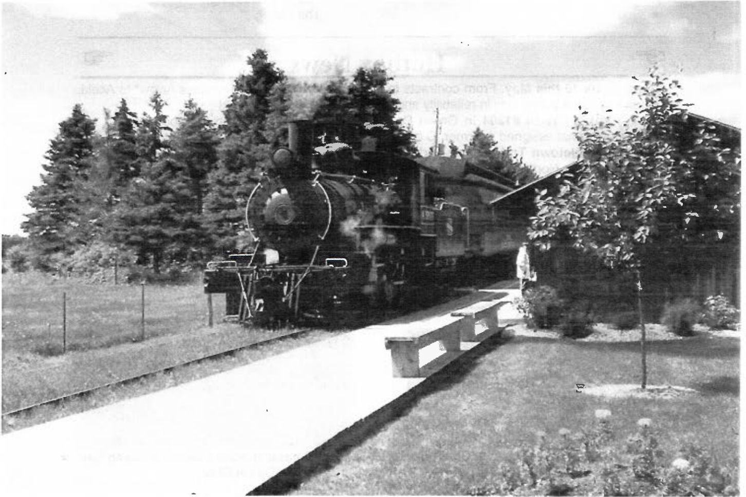
Laona & Northern "4-Spot" at Laona, WI, 1997

"The Official Publication of the Teen Association of Model Railroaders"