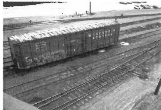
WC 27310 at the same yard 4/27/2011.