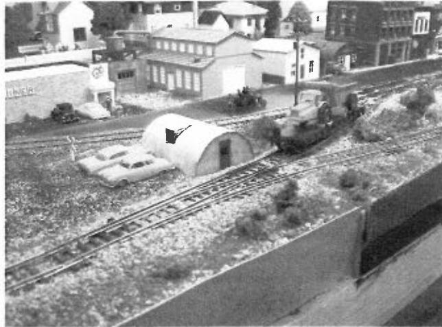
The completed model, also note the scratch-built Quonset hut and a model of my paternal Grandfather's salmon color Studebaker.

true was an earth mover which became the basis for this project. The inspiration for this project from Jim Hediger's article (Chains, Chocks, and Shackles pages 80-83) in the June 2005 issue of Model Railroader . For my model however, I used the Athearn 40' flatcar and the Matchbox earth mover. I also simplified the blocking and tie downs as seen in fig. 1 because as it said in the article that the chain tie downs were not required but may be used by shippers to provide additional stability and for the fact that I didn't want to drill into the model. For the blocking, I used 3/32"x3/32" balsa cut into twelve 1/4" lengths. For the positioning of this, consult fig. 1. After adding the blocks, I took inexpensive jewelry chain and fed very thin copper wire through the first link and in turn this fed through the second stake pocket forward from the rear tire. Then take the wire and drop it over the rear axle, cut it to fit the second pocket aft the rear tire and super glue that link to the pocket (this is also shown in fig. 1). There you have it, another simple satisfying project. 📌