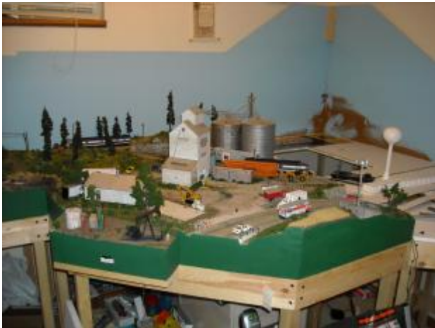
Grain Elevator complex module.

It gives you a lot of motivation to complete the task at hand. Another reason to have a module layout is portability; not necessarily to take the layout to shows, but to be able to enter a module in a contest, and to be able to get the entire layout out of the room, if needed. None of those things were possible with my last 4x8' layout. It had a tall mountain with a tunnel, which would not fit through the door in one piece.