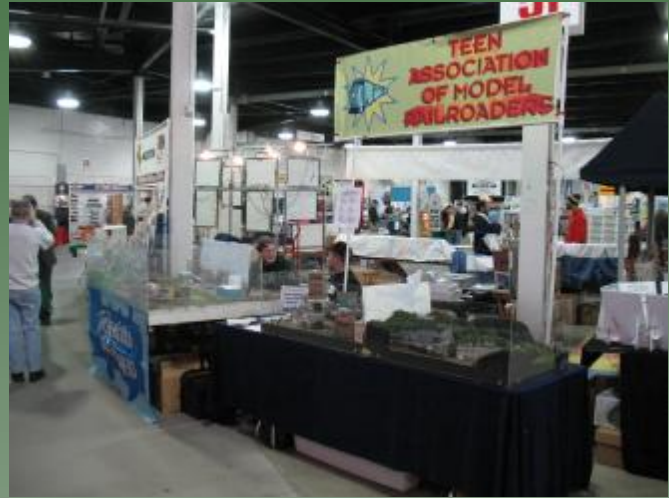
Our tables at this past years Big Rail road Hobby Show held in West Springfield, MA at the Eastern States Exposition Center (the Big E). Held January 24-25. We featured two operating layouts this year one in HO the other,