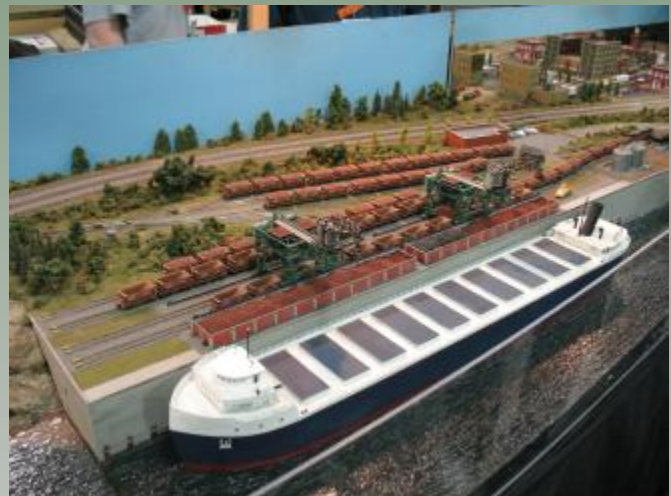
One of the many awesome modules on one of the many awesome layouts on display at the above mentioned train show. This was on the Northeast N-trak layout featuring a ore dock loading scene complete with scratchbuilt ore boat.