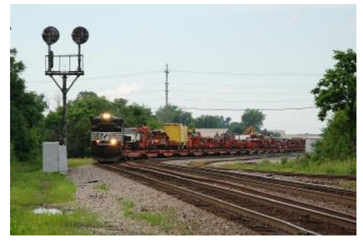
An NS work train approaches the diamonds at Marion, OH, on June 28, 2008, during the Summer National Convention.