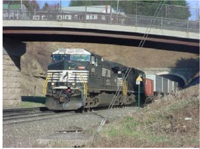
NS train coming out of the Galitzen Tunnel.