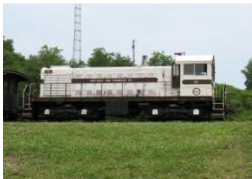
Big South Fork Scenic Ry.'s Alco S2 basks in the July sun just outside the Stearns, KY Depot.

I'd like to get some help from other members with texturing this model. Once I get the texture images built, I'll gladly send the image files for any combination of S-2, S-4 or RS-1 around in any format that you want (.bmp, .jpg, Photoshop, etc.) The texture images should be pretty self-explanatory, since they'll have all the hood doors, windows, and