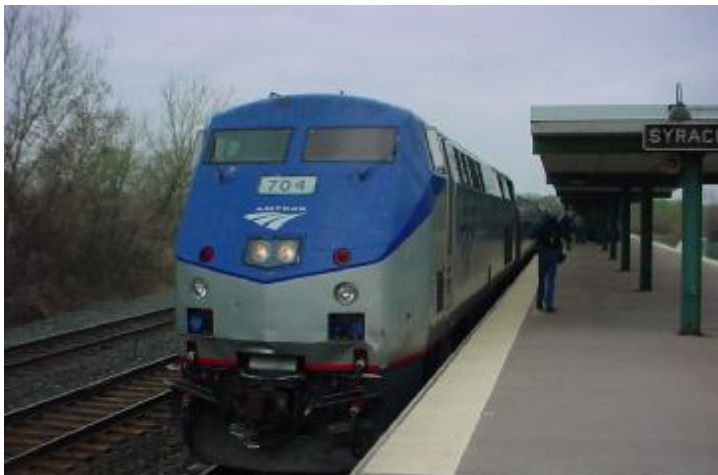
Amtrak's westbound Lake Shore Limited (a.k.a. Late Shore Limited) arrives 4 1/2 hrs late at Syracuse, Led by #704.

Keep a look out for the next edition when I talk about a place many TAMR members have been to. Selkirk, NY!●