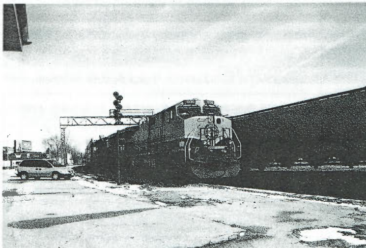
BNSF 1030 IS WESTBOUND AT ELKHART

Elsewhere in Elkhart, shortline Elkhart & Western's locomotives can be viewed relatively easily. The E&W "terminal" consists of three tracks behind a shopping plaza just north of downtown. Although a construction company's office building shelters the locomotive storage area from a nearby parking lot, the two GP units can typically be seen quite well from other parts of the lot.