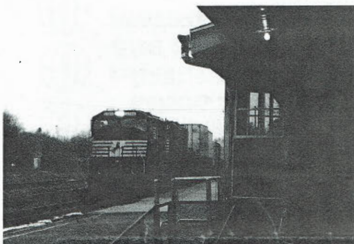
NS 6766 LEADING AN EASTBOUND INTERMODAL TRAIN OUT OF THE ELKHART YARD PAST THE OLD NEW YORK CENTRAL DEPOT IN DOWNTOWN ELKHART, INDIANA.

One of the nicest things about Elkhart (from a railfan perspective, anyway), is the steady stream of trains in and out of town. Elkhart lacks quiet zones (at least, the last time I checked there were none), so if you're at either the depot or the museum, you can hear trains coming and going. Although it's often times hard to tell (at first) if the train you hear is coming or going, the audible whistle signals add a nice touch to the railfan experience.