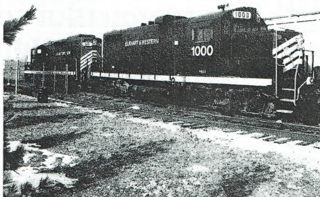
ELKHART & WESTERN POWER PARKED AT THE E&W TERMINAL IN ELKHART, IN.

the parking lot on the south side of the road, you will wind up in the parking lot of the Elkhart Depot. The depot is an old building, slowly deteriorating due to lack of funds and a not-yet-begun restoration by the City of Elkhart, which also owns the building. In fairly recent times, the building housed the Amtrak station for the Elkhart stop, but not much else.