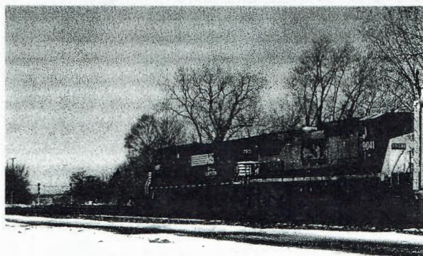
WHOSE RAILROAD IS THIS ANYWAY? NS 8350 LEADS CSX 9041 WEST OUT OF DOWNTOWN SOUTH BEND ON NS'S CHICAGO LINE. MARCH 8, 2007.

From the joint Canadian National/Norfolk Southern line through downtown, to the South Shore line's relatively cheap alternative to driving to Chicago to the four daily Amtrak stops in the city (2 eastbound trains, 2 westbound trains), South Bend is the host to well over 100 trains each day.