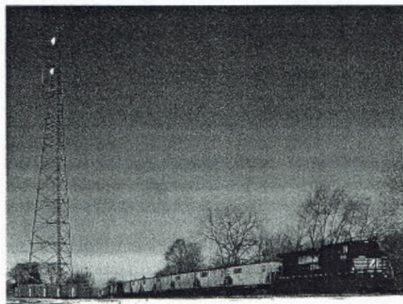
NS 8421 LEADS COAL EMPTIES EAST INTO DOWNTOWN SOUTH BEND ON MARCH 8, 2007. AMAZINGLY ENOUGH, THE TRAIN ACTUALLY APPEARS SHORT COMPARED TO A NEARBY RADIO TOWER.

Where I'm from, the scanner is almost an essential part of any good railfan's gear. In the state of Indiana, scanners (capable of picking up police frequencies) are illegal, unless you have an