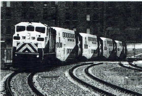
TRINITY RAIL EXPRESS, ROLLS INTO FORT WORTH, TX, JUNE 2002.

-Railfanning to Taylor: Railfanning all the way along the Austin Subdivision from Kerr through Round Rock, Hutto, and Frame Switch, all the way to Taylor. Location of a medium-size yard, several rail-served industries, and an interlocking between the UP's Austin (ex-MP) and Waco (ex-MKT) Subs.