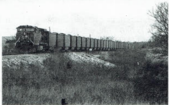
A PAIR OF OLD ESPEE UNITS GIVE A PUSH ON THE BACK END OF A UP TRAIN NEAR SHERMAN, TX, NOVEMBER 2004.