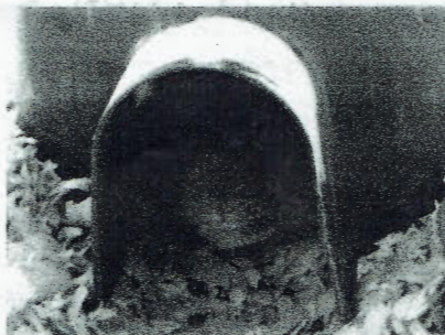
BET YOU'VE NEVER SEEN HOW NICE LEGO TRAINS ARE... COME TO THE INFORMAL TAMR GATHERING IN NAZARETH TO FIND OUT!

This year, a co-worker at my hobby shop, who recently started an N-trak modular layout club, trak-ed* me down and asked if I planned to do the display again. I also heard from my friend from school who provided the G scale for the first show, asking if I was going to organize another display. I decided to do so, and I had the idea in my head for less than a day when I realized that this could be a great opportunity to meet other TAMR members, and even hope to get the message out about our group, and get new members.