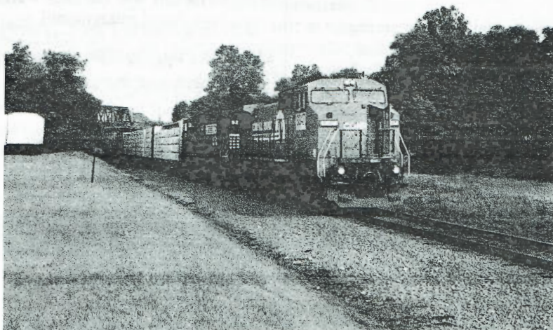
NS EASTBOUND FREIGHT 18G IS SEEN AT PHILLIPSBURG, NJ WITH AN EX-CONRAIL UNIT LEADING.