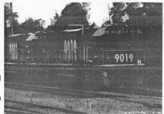
90-CLASS LOCOMOTIVES PULLING A COAL TRAIN.

that, you are bound to expect at least 4 of these trains while during your daytime railfanning! At present, there are two operators that run container freight on a regular basis, Pacific National (Let's compare them to... Union Pacific) and Queensland Rail National