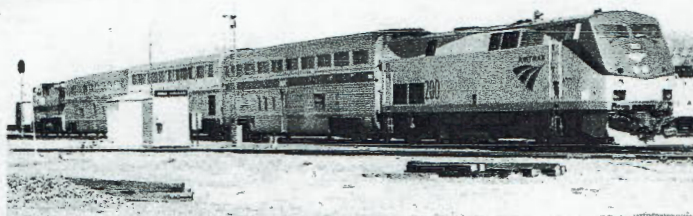
SOMETHING FOR THE RAIL-HISTORIANS OF TOMORROW?

So what about the train buffs of tomorrow? Well, my friends, that is where you come in. We in the TAMR are most likely the biggest railfans, model railroaders, and rail preservationalists in our generation. After all, we made the step to join the group here! As the railroad nuts of the 21st century, we do still have some power to help ensure that our favorite lines are remembered into years to come.