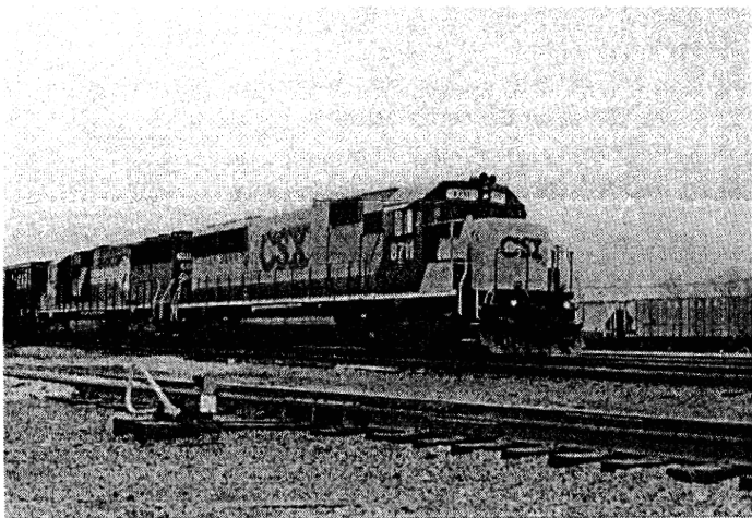
CSXT (exCR) SD50 #8711 and sister SD50 both set at the east end of CSXT Parsons Yard in Columbus.

This is where TAMR Central Region members can show off their photos, whether it be the most recent, or the "oldies"!! E-mail or snail-mail your photos to me!! If snail-mailed, I will send them back upon request. So, here are some photos!!!