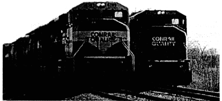
CR SD80MAC #4101 and CR SD60M #6342(?) set side-by-side at the crew change point just south of Crestline, OH.